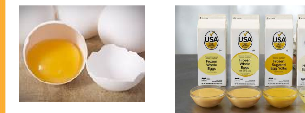
Table egg exports for June 2020 were 11.6 million dozen, up 0.4% from the same month of last year, while export value was $8.2 million, up 3.9%. June exports to Mexico increased by 154% year over year to 5.2 million dozen, while exports to Hong Kong decreased by 35.2% to 3.8 million dozen and exports to Canada dropped by 97.8% to merely 56,224 dozen. Shipments to the U.A.E., Oman, Guatemala, and Bahamas increased.

Cumulative exports of table eggs for January through June this year were 65.0 million dozen, up 1.5% from the same period a year earlier, while export value reached $59.2 million, up 14.7%. Of the total shipments, 91.3% or 59.4 million dozen were shipped to the top six export markets, namely Hong Kong, Mexico, Canada, the U.A.E., Bahamas, and Israel.