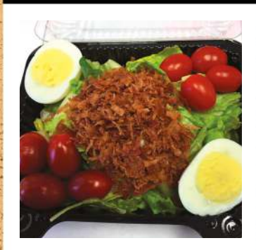
BLT Salad - Palatine CCSD 15, IL