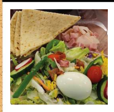
Cobb Salad - Cobb County SD, GA