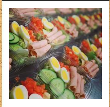
Chef Salad - Orange County SD, FL