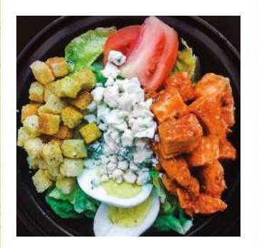
Buffalo Blue Chicken Salad