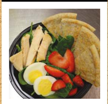
Spinach & Strawberry Salad